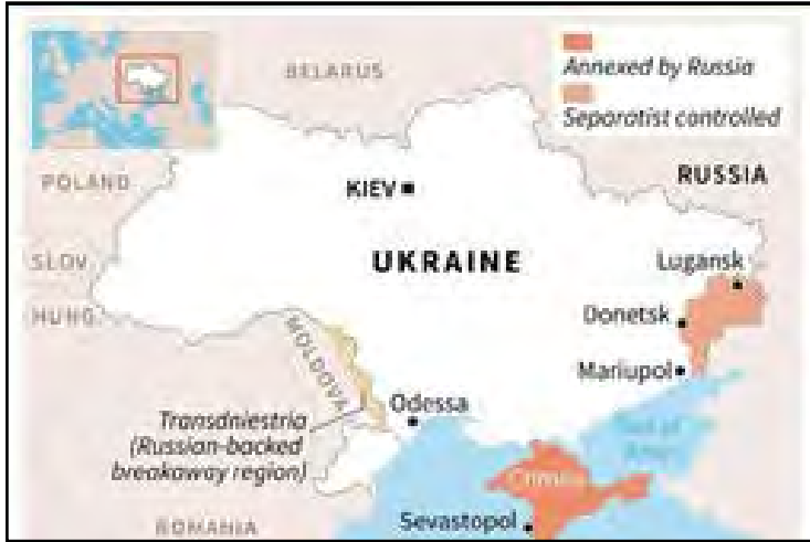
Map of Ukraine showing territory occupied by pro-Russian separatists in the east and Russian-annexed Crimea.

7 Apr 2021 | Agence France Presse | By Olga Shylenko