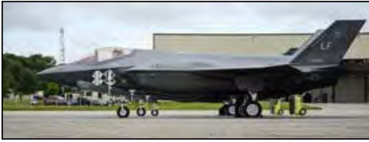
A F-35A Lightning II jet fighter stands ready to depart RAF Fairford, England, for the United States on July 13, 2016.